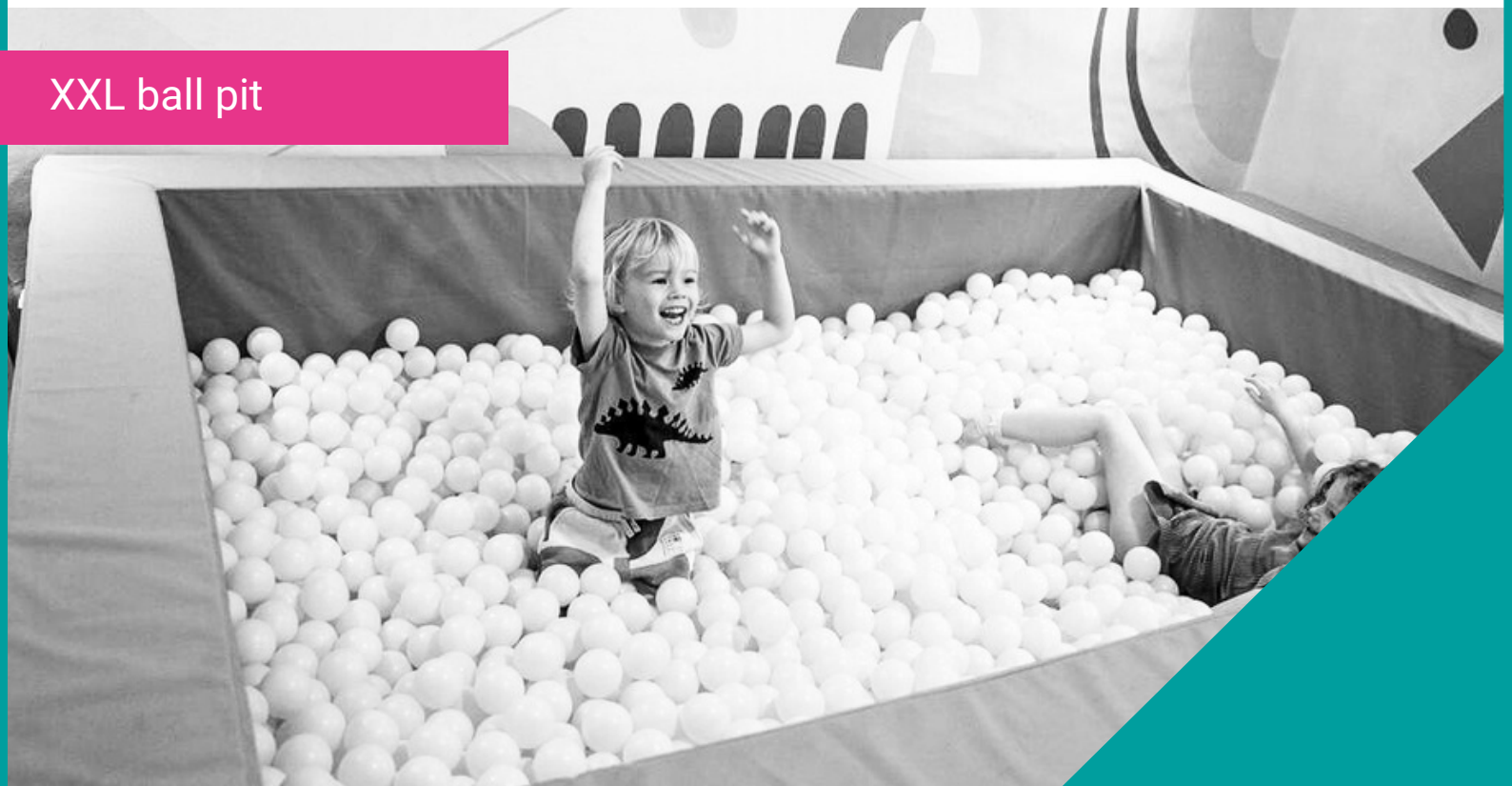
XXL ball pit